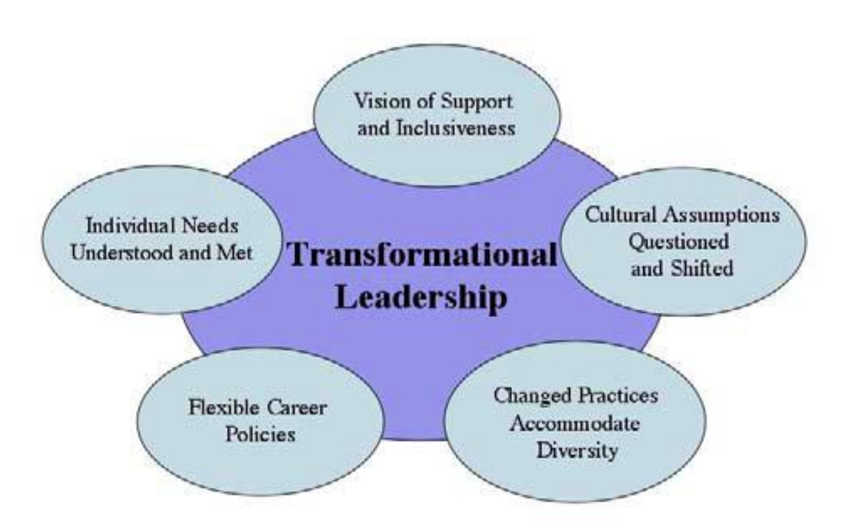
Figure 1: Transformational Leadership Model

faculty and staff; (c) peer mentoring circles for women faculty; and (d) entrepreneurship training for faculty women. Each activity attempts to include aspects of structured work, peer networking, and reflective practice.